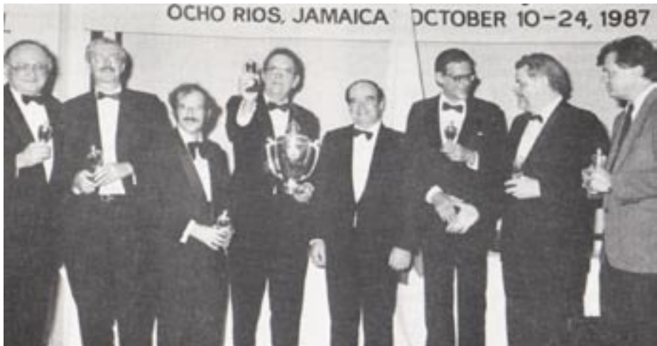
The 1987 Bermuda Bowl winners: USA

and Lawrence-Ross) and the challengers from Great Britain (Flint-Sheehan, Kirby-Armstrong, Brock-Forrester). The talk of the championship is, however, on the hot issue of the day: the proliferation of highly unusual systems (also adopted by two of the British pairs) which included the so-called strong pass (in brief: the unusual