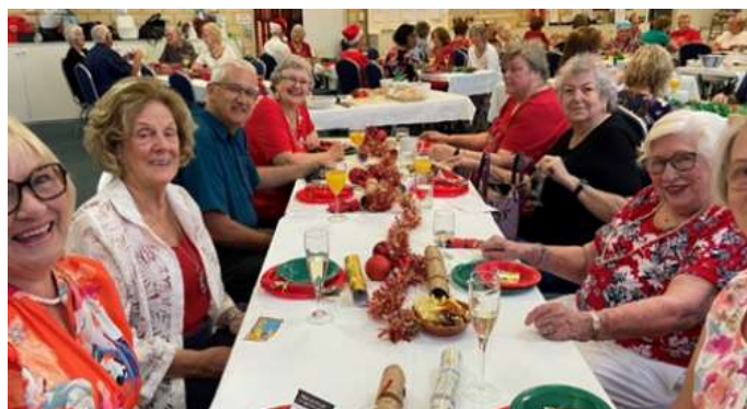
A packed house for the 2020 Christmas party