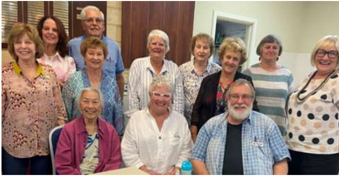
The Fremantle Team