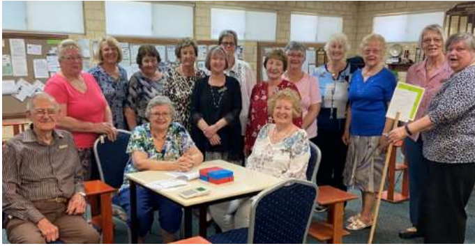
The Rockingham Team